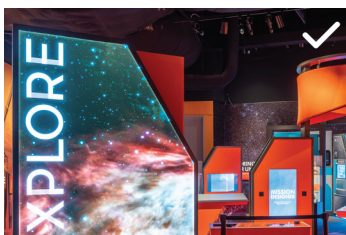
Neil Armstrong Space Exploration Gallery, presented by the Harold C. Schott Foundation 2019-2020