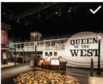
Public Landing 2018