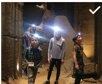
The Cave 2019