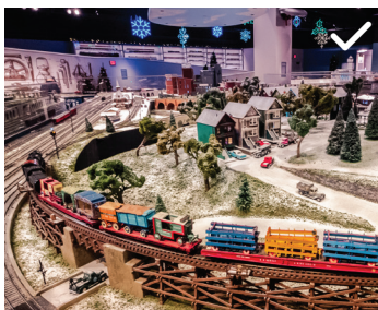
Holiday Junction 2018