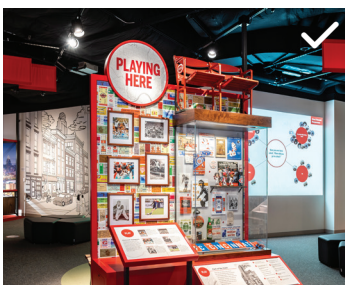
You Are Here 2020