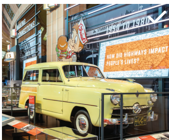
Shaping Our City 2020