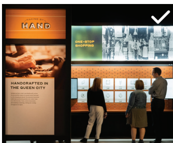
Made in Cincinnati 2022