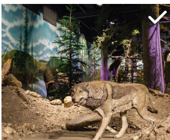
Ice Age Gallery 2021