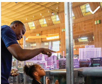
Cincinnati in Motion 2019