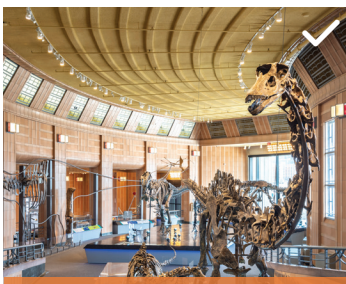
Dinosaur Hall 2018/ Paleontology Lab 2019