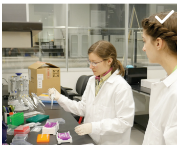
DNA Lab 2018