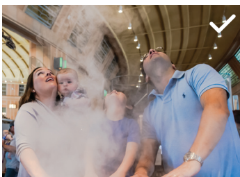
Science Interactives Gallery, presented by Procter & Gamble 2019