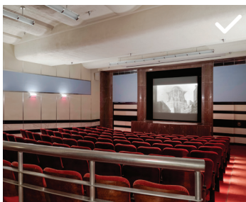
Newsreel Theater 2018