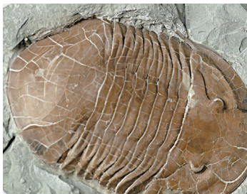
Ancient Worlds Hiding in Plain Sight Coming 2023