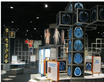
Biomedical Science Gallery Coming 2024